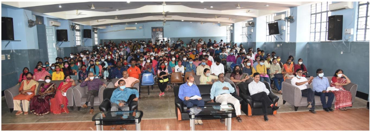
Orientation on Code of Conduct 2021-22 REGIONAL INSTITUTE OF EDUCATION ,BHUBANESWAR