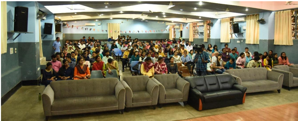
Orientation on Code of Conduct 2022-23 REGIONAL INSTITUTE OF EDUCATION ,BHUBANESWAR