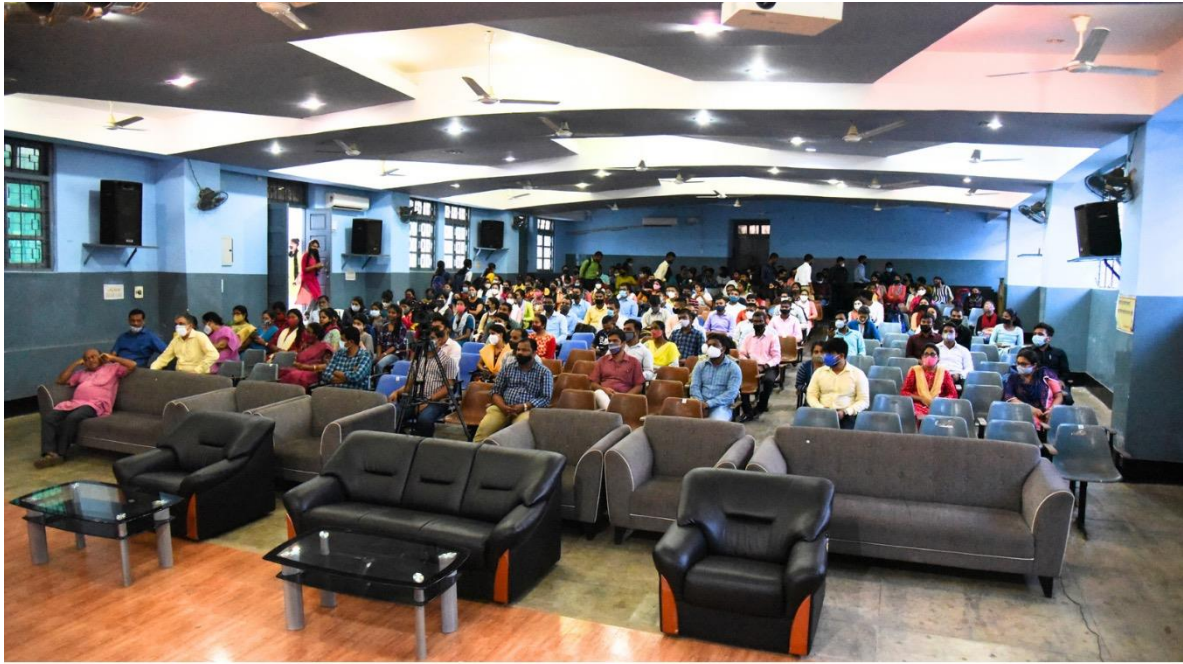
Orientation on Code of Conduct 2021-22 REGIONAL INSTITUTE OF EDUCATION ,BHUBANESWAR