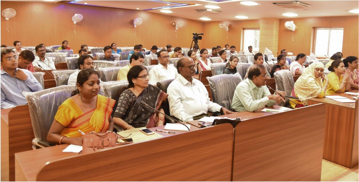
Orientation on Professional Ethics for Staff REGIONAL INSTITUTE OF EDUCATION ,BHUBANESWAR