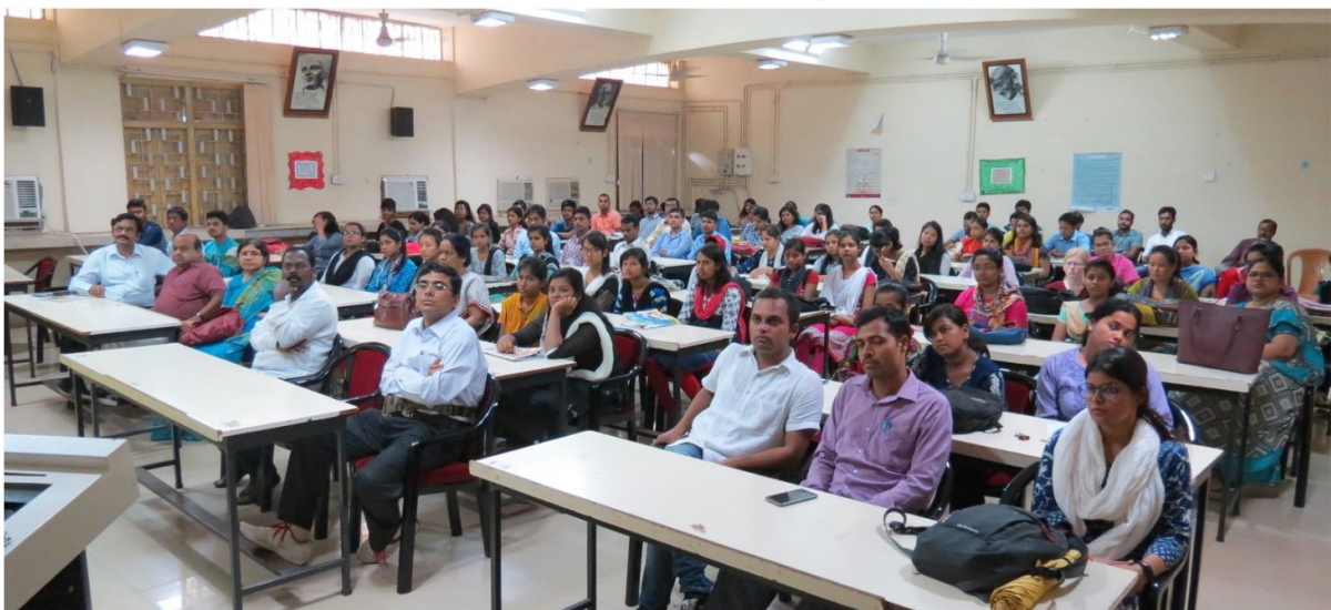
Orientation on Code of Conduct 2017-18 REGIONAL INSTITUTE OF EDUCATION ,BHUBANESWAR