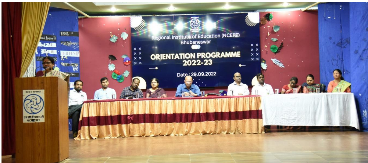
Orientation on Code of Conduct 2022-23 REGIONAL INSTITUTE OF EDUCATION ,BHUBANESWAR