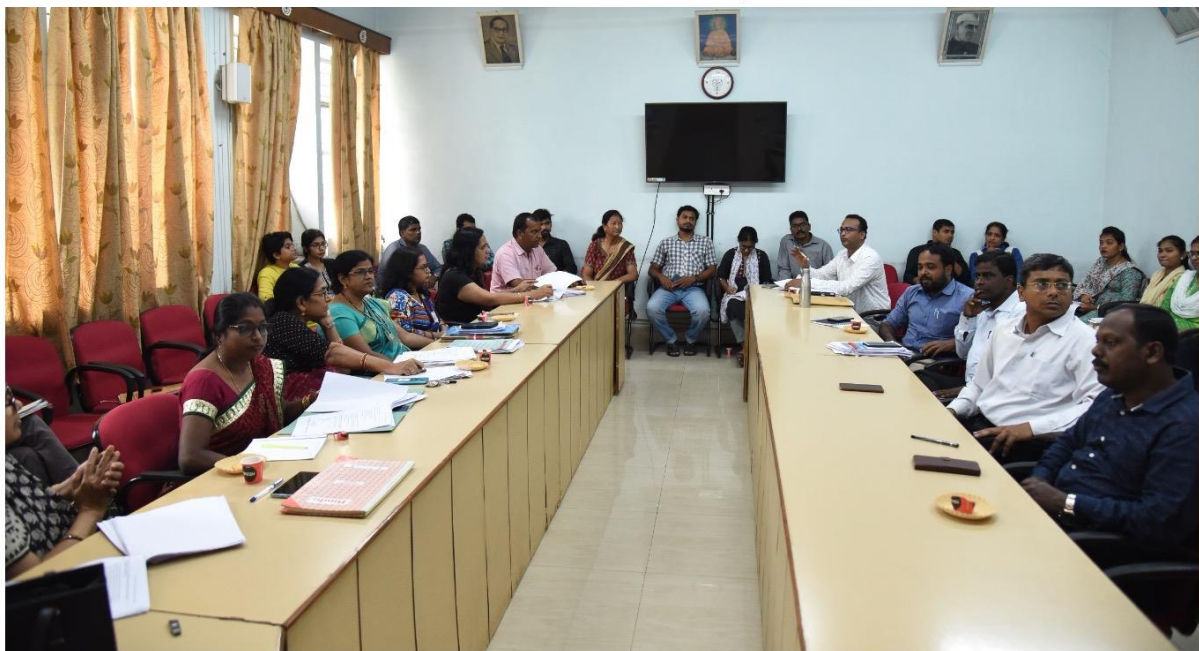
Orientation on Professional Ethics for Staff REGIONAL INSTITUTE OF EDUCATION ,BHUBANESWAR