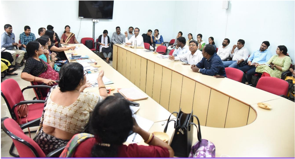
Orientation on Professional Ethics for Staff REGIONAL INSTITUTE OF EDUCATION ,BHUBANESWAR