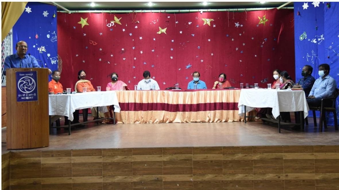
Orientation on Code of Conduct 2021-22 REGIONAL INSTITUTE OF EDUCATION ,BHUBANESWAR