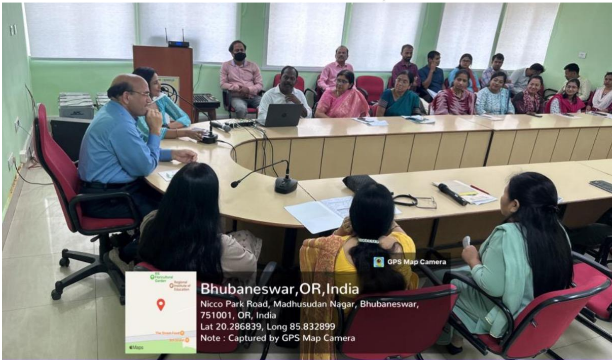
Orientation on Professional Ethics for Staff REGIONAL INSTITUTE OF EDUCATION ,BHUBANESWAR