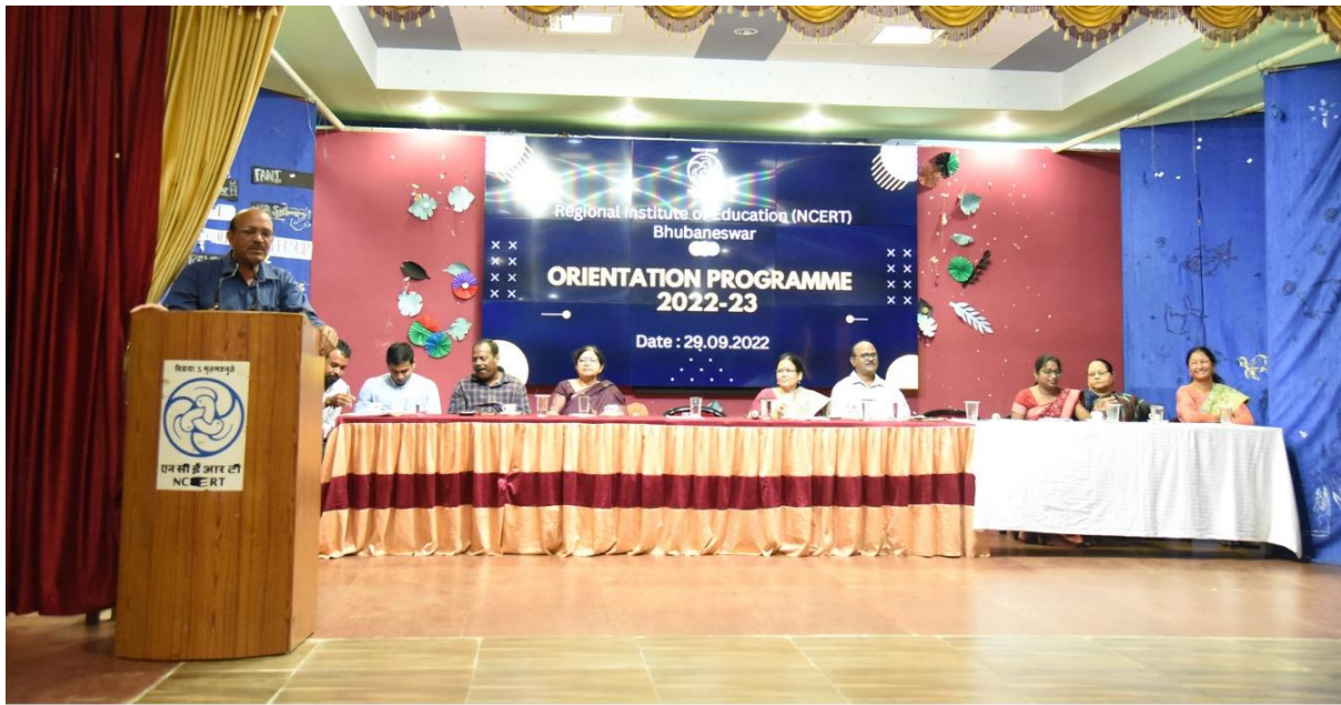
Orientation on Code of Conduct 2022-23 REGIONAL INSTITUTE OF EDUCATION ,BHUBANESWAR