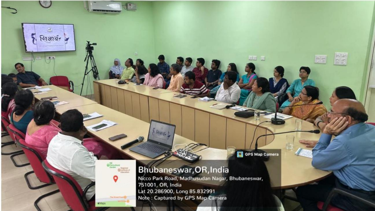
Orientation on Professional Ethics for Staff REGIONAL INSTITUTE OF EDUCATION ,BHUBANESWAR