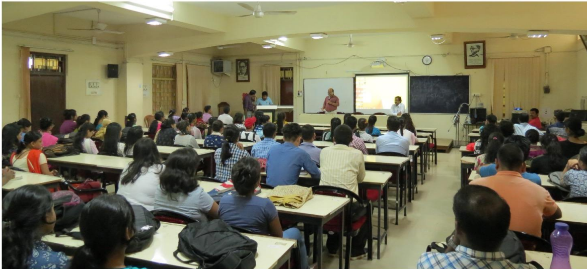
Orientation on Code of Conduct 2017-18 REGIONAL INSTITUTE OF EDUCATION ,BHUBANESWAR