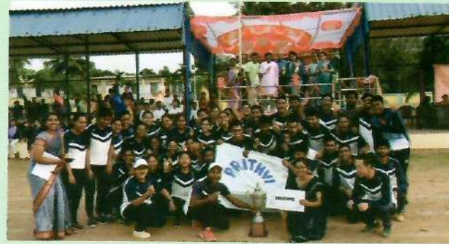
Best Marpast winner Prithvi House with Running Shield