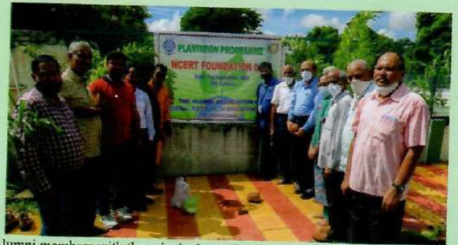
Alumni members with the principal near Tennis Court on plantation programme