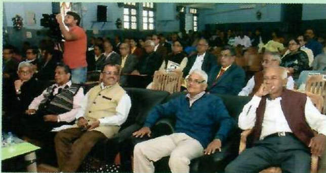
Guests and alumni watching the programme