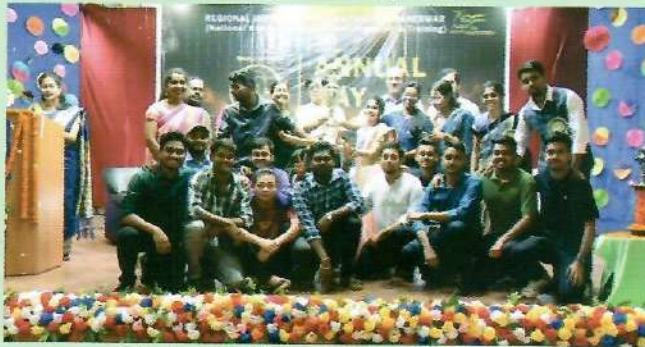
Members of Prithvi House with Chief Guest awarding running shield for Best Literary Activities.