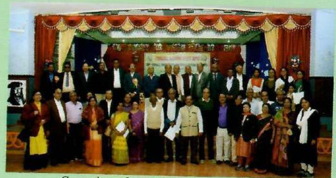
Group photo of participant of Annual Meet-2019.