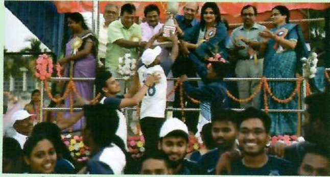
Our Office bearers with principal & chief Guest awarding running shield cup in the RIE Sports Meet- 2021