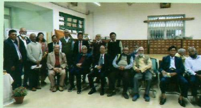
Alumni members with Guest on opening of the Alumni corner