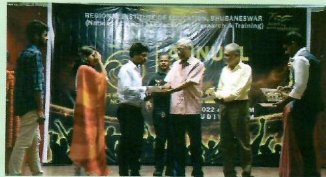
Alumni Office bearers awarding Prize in RIE Annual Day 2022