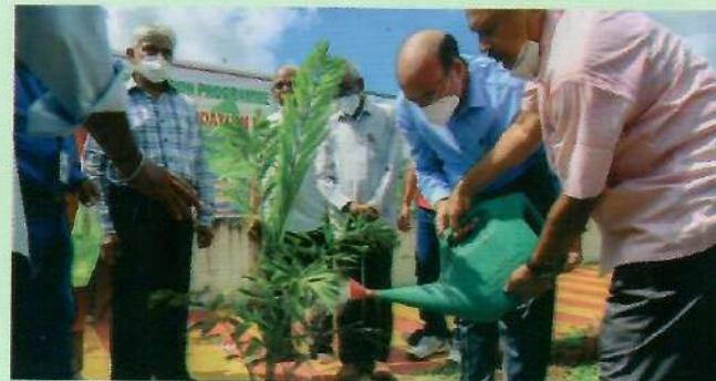
Principal inaugurating the plantation programme launched by Alumni Assn