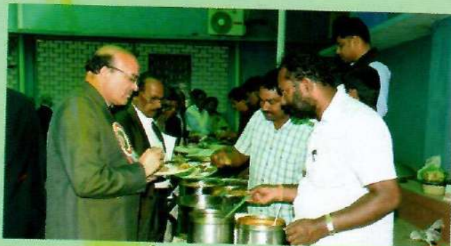
Guests at the Food counter