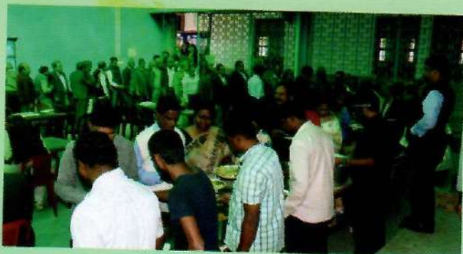
Participants in the Dining Hall