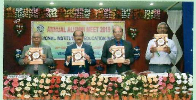
The 7th issue of Alumni Newsletter being released