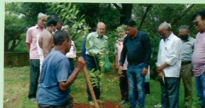
Alumni members engaged in plantation