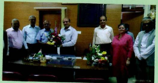
Alumni Assn. greeting the Principal in the New Year - 2023