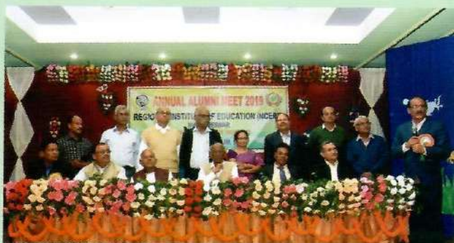
The new and old E.C. members together