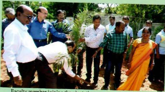
Faculty member joining the plantation programme on the campus