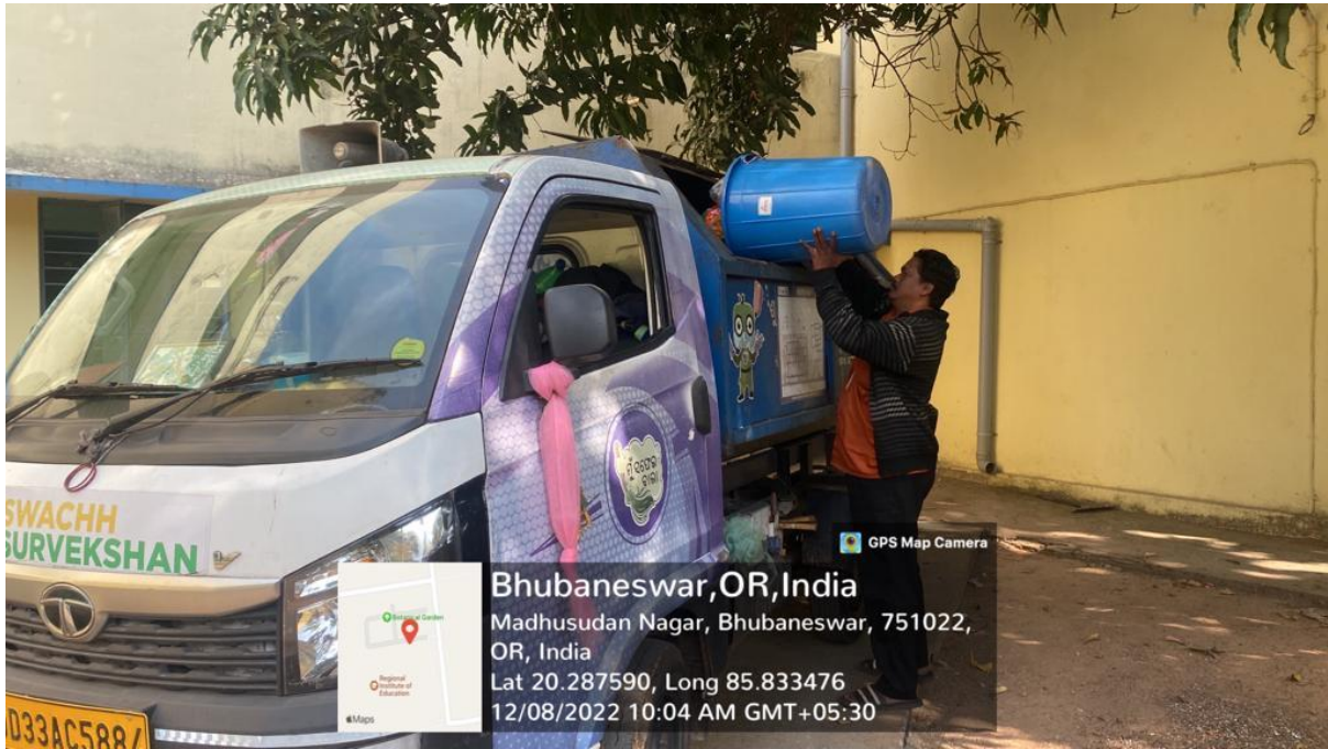
Two dustbins are kept for segregation of wastes

Bhubaneswar, OR, India Madhusudan Nagar, Bhubaneswar, 751022, OR, India Lat 20.287590, Long 85.833476 12/08/2022 09:02 AM GMT+05:30