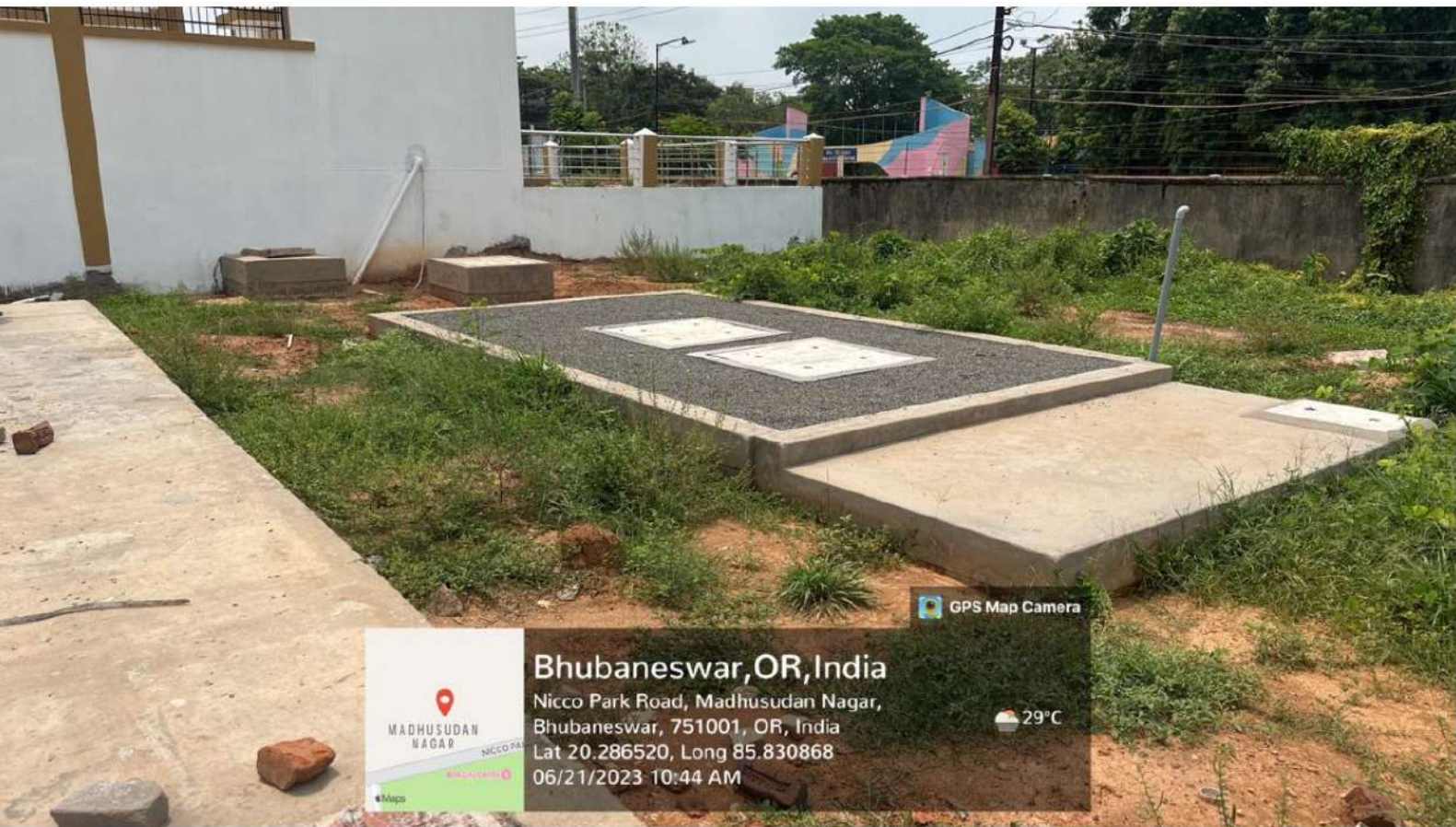
SEWAGE TREATMENT PLANT REGIONAL INSTITUTE OF EDUCATION ,BHUBANESWAR