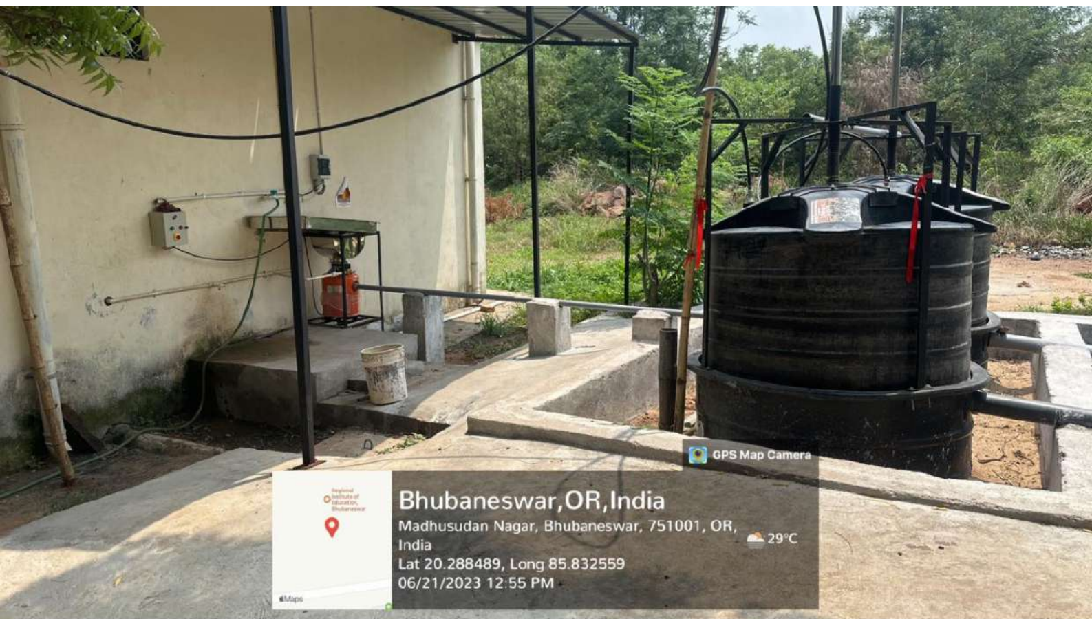
BIO GAS PLANT REGIONAL INSTITUTE OF EDUCATION ,BHUBANESWAR